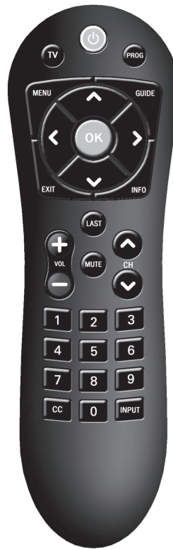
OCE-0189A REV 01 (08/25/16)